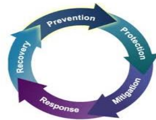
FIGURE 1: PHASES OF EMERGENCY MANAGEMENT

Emergency management is best conceptualized as a cycle of prevention, preparedness/protection, mitigation, response, and recovery activities as shown in Figure 1. The more complete the preparedness, the shorter the response and recovery time for any emergency.