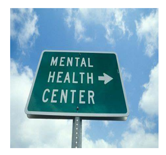
Mental Health Centers Supported Employment Kick-Off on 9/18/19