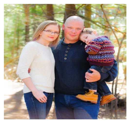
Diversity Workforce Coalition Military Employment Presentation on 11/5/19