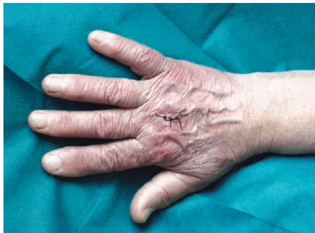
Figure 4. Illustrative example of a patient with acrodermatitis chronica atrophicans.

1. Available data indicate that acrodermatitis chronica atrophicans may be treated with a 21-day course of the same antibiotics (doxycycline [B-II], amoxicillin [B-II], or cefuroxime axetil [B-III]) used to treat patients with erythema migrans (tables 2 and 3). A controlled study is warranted to compare oral with parenteral antibiotic therapy for the treatment of acrodermatitis chronica atrophicans.