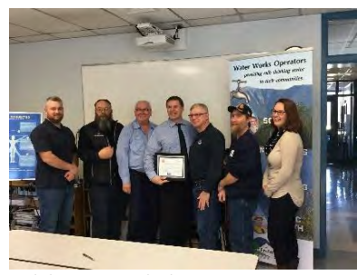
Celebrating with the Water Treatment Division, City of Concord for receiving a CDC Water Quality Award