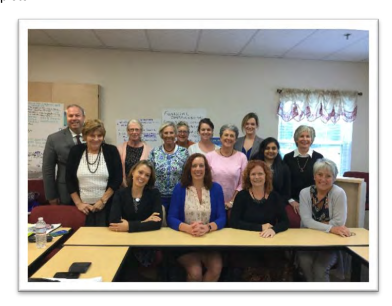
2018 Strategic Planning Summit Participants

Our team includes dental and medical providers, policy-makers, health and equity partners, professional and provider associations, and philanthropists.