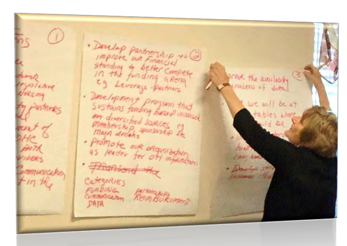
Regina Blaney, NH Oral Health Coalition engaged in strategic planning activity